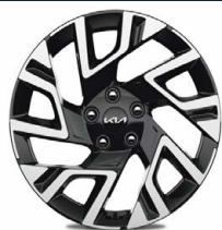
PHEV - 18" alloy